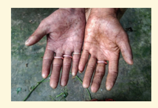
Congenital palmoplamterkeratodrma of a Bangaladeshi male<sup>16</sup>

BBC reported in December 2020, that a Bangladeshi family where 3 generations had no fingerprints faced obstacles in issuing national ID cards, driving licences, buying SIM cards and office attendance systems. A dermatologist in Bangladesh has diagnosed the family's condition as congenital palmoplantar keratoderma. More genetic testing would be needed but these were not available in this resource-poor country. They got their NID card issued by the Bangladesh Governmentafter presenting a medical certificate. The cardused other biometric data tooretina scan and facial recognition. 16